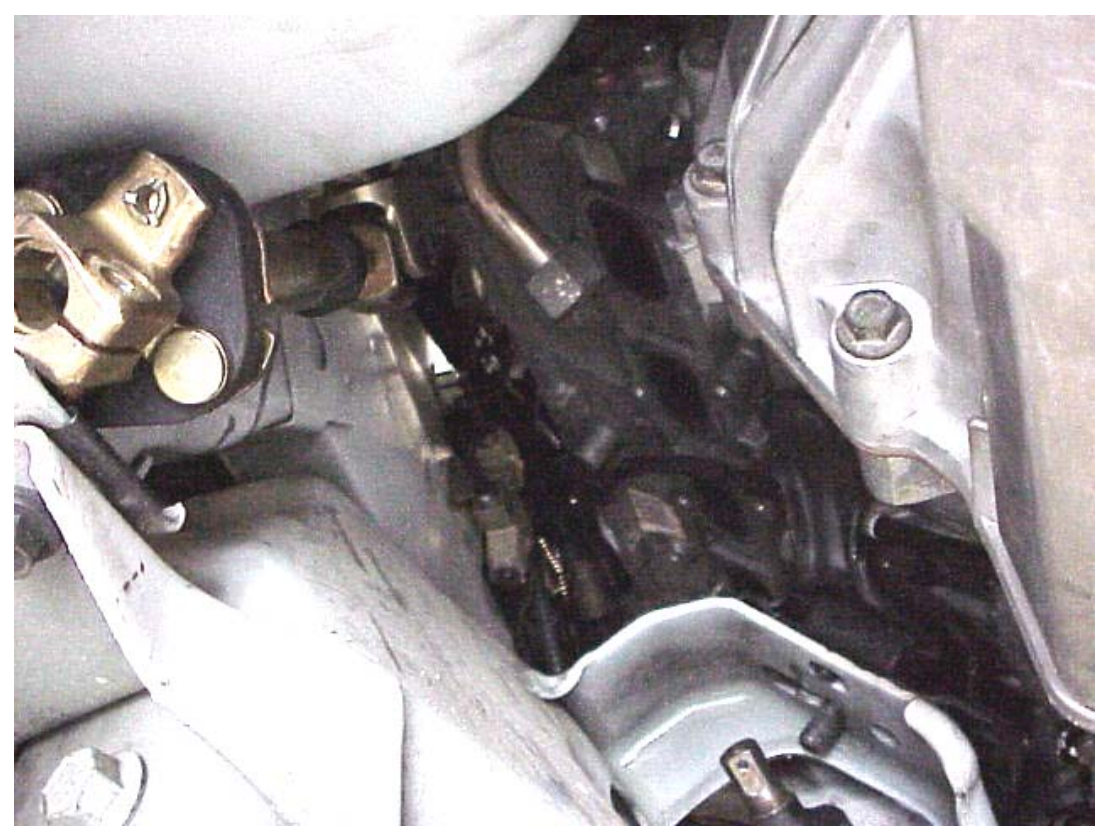
Figure 3 Driver side of engine ready for header installation

40. Slide the second new JBA -supplied Mr. Gasket Ultra-Seal gasket up into its position on the head. ( Be sure the gasket area of the head is clean. If not, clean the head surface. ) Thread one of the JBA -supplied bolts and lock washers part way into the location where the new header is slotted to slip over the bolt (bottom row, 2<sup>nd</sup> from the back).