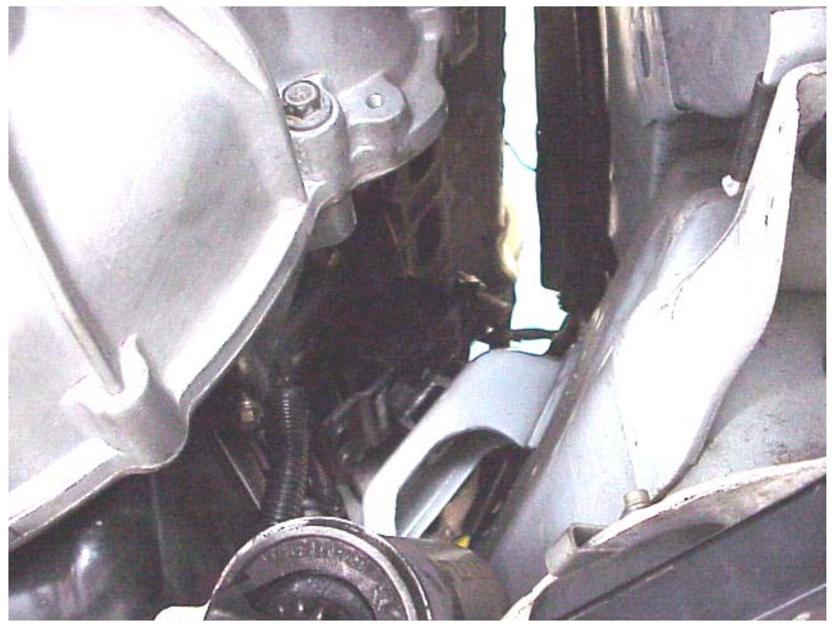
Figure 1 Passenger side of engine ready for header installation

27. Remove the center lock pin from the 2-piece plastic fastener securing the A/C line along the passenger side manifold. Then, bend the soft aluminum A/C line slightly upward, and reattach it with the original bracket and fastener into the alternate hole located approximately 2" above and 4" behind (toward the rear of the car). DO NOT INVERT THE BRACKET! If you do, the line will not be adequately relocated. Refer to the illustration below.